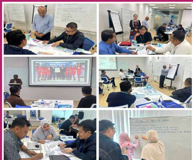
Engaging and Fun Classroom Lessons