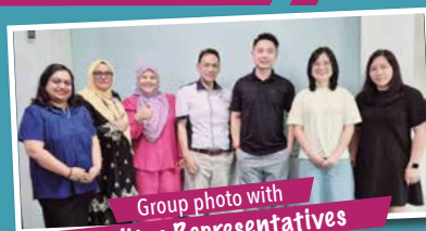
Group photo with Qualitas Representatives

Looking forward to a great collaboration with Qualitas.