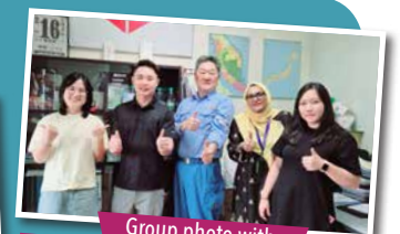
Group photo with Sankyu JB Management Staff