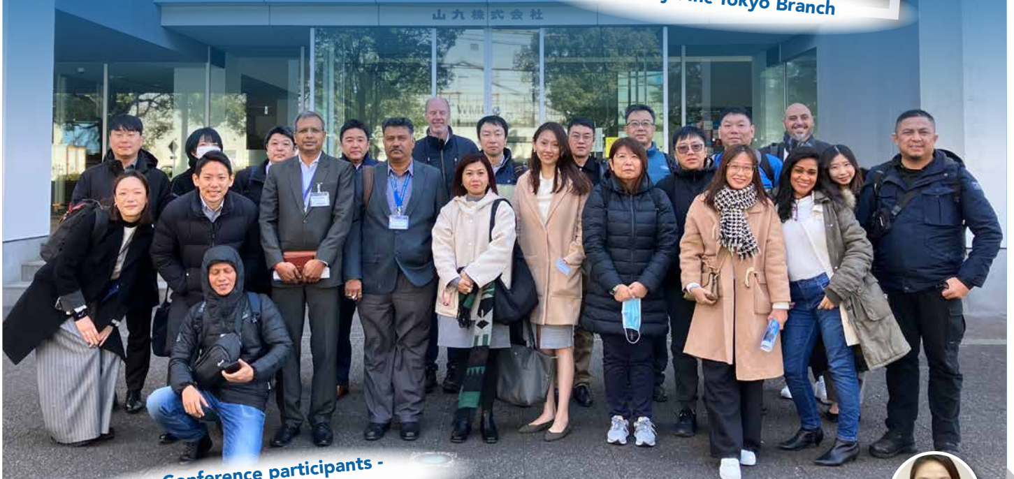
Conference participants - head office